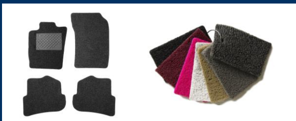
Car mats and mats for multiple purposes