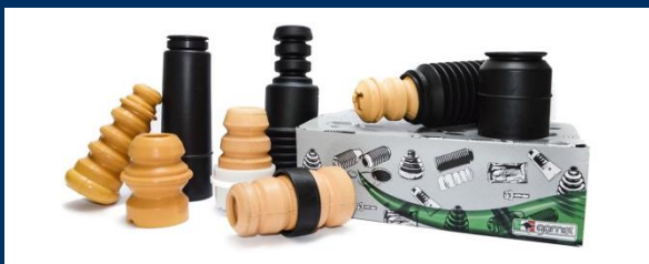
Dust covers, Bounce bumpers and Shock Absorber Service Kits ("SASK")