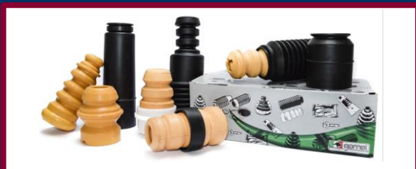
Dust covers, Bounce bumpers and Shock Absorber Service Kits ("SASK")