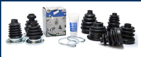
Cv-Boots as bulk and kits