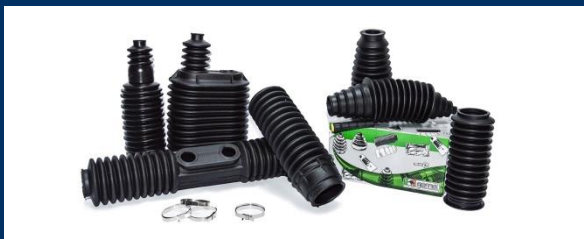
Steering gaiters as bulk and kits