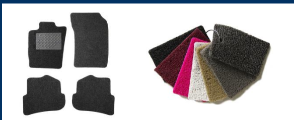
Car mats and mats for multiple purposes