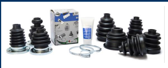
Cv-Boots as bulk and kits