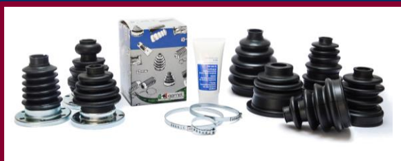
Cv-Boots as bulk and kits