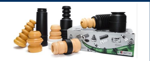
Dust covers, Bounce bumpers and Shock Absorber Service Kits ("SASK")