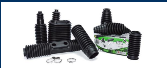
Steering gaiters as bulk and kits