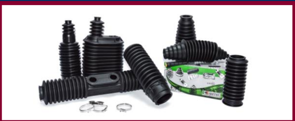
Steering gaiters as bulk and kits