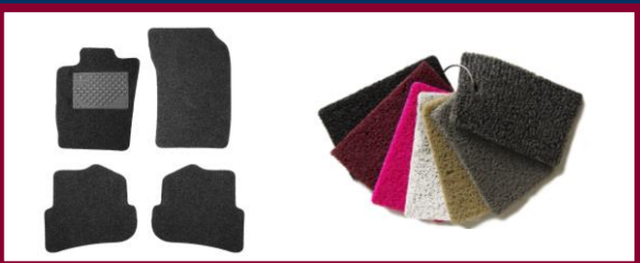
Car mats and mats for multiple purposes