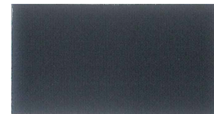
TERASIL® Black WW-KSN 150%