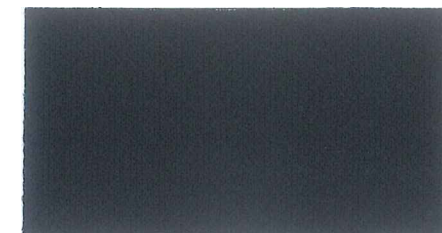
TERASIL® Super Black W