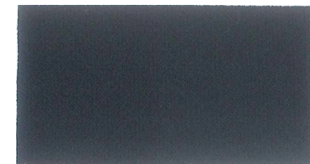
TERASIL® Black W-S