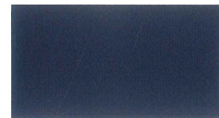
TERASIL® Navy W-S