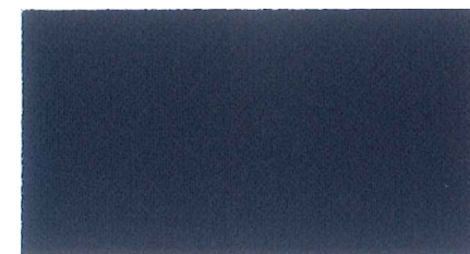
TERASIL® Navy WW-GSN