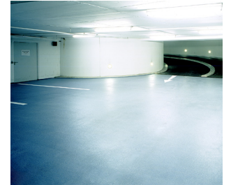
Premium VOC-free flooring

The result of marrying the two companies' chemistries together is adhesive, coating and elastomer (ACE) solutions that can be engineered to meet individual customer needs.